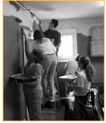
St. Aidens caption