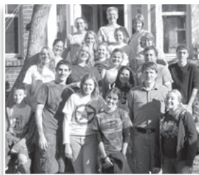
Volunteers at our Broadway Avenue facility

Opportunities abound for volunteers interested in sharing their culinary talents.