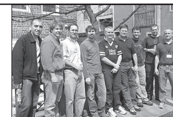
MWH Global helps with yard work at Broadway House

Congregation Har HaShem • CoPRIG at CU Boulder • Emmaus Road Community Church • Intrado • Kiwanis Club of Longmont • Kiwanis Club of the Golden Nugget • Level 3 Communications • McKesson Health Solutions • MWH Global • National Institute of Standards & Technology • Sharefest • Summitview Church • Trinity Lutheran Church